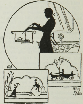
Silhouette towels are fun to embroider and make splendid gifts. A pair of them, stamped on good quality huck, is number 619 at 67 cents.

stant joy. If you do not care to buy our tints and curtain material, pattern number 227 will be sent for 18 cents. This supplies exact cutting pattern for each part with instructions and diagram showing their placings. If you want to buy the material for the design parts, nineteen units for one panel or curtain, stamped on finest, firm weave, fast color gingham in the four colors, as number 228 at 45 cents, will be sent to you.