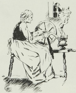
Dame Margot span her own yarn.

"Yes, mam," Gustaf answered meekly enough and held out his hand to Johanna, "I'll watch her, Mrs. Jaeger, so she don't fall nowhere."