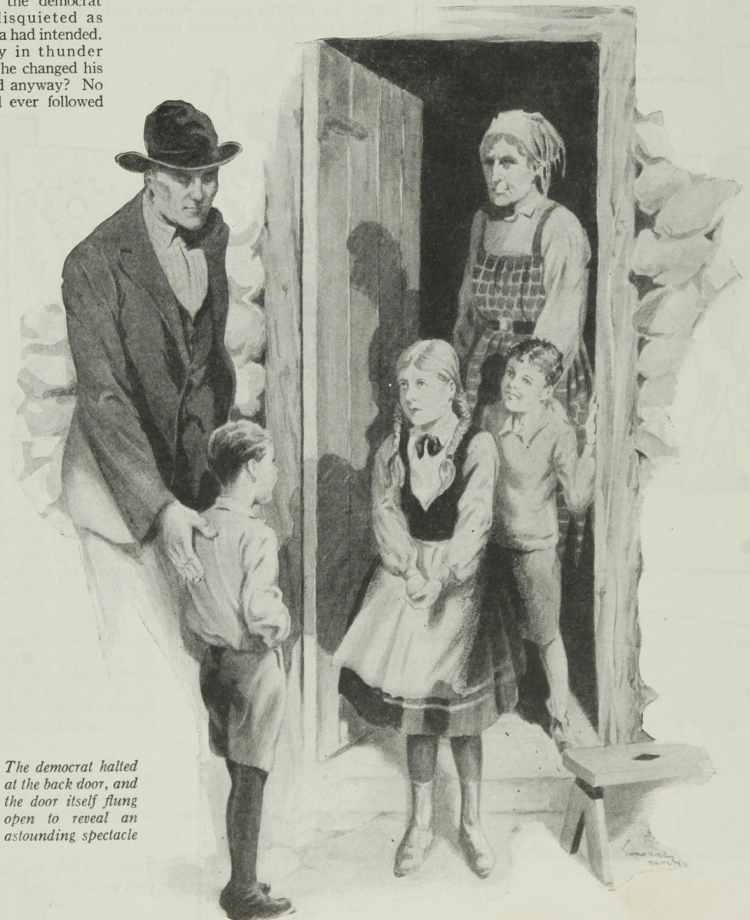
The democrat halted at the back door, and the door itself flung open to reveal an astounding spectacle